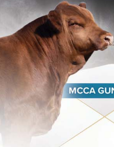
MCCA GUNNER 947G