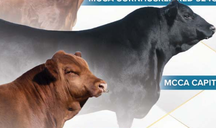
MCCA CAPITOL HILL 516C