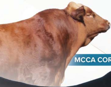
MCCA CORNHUSKER RED 524C